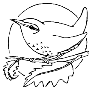
Stawley Primary School