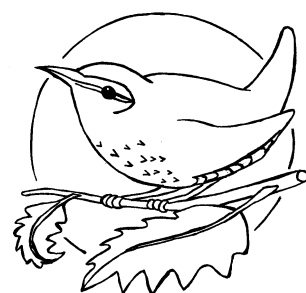
Stawley Primary School